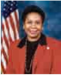
Congresswoman Sheila Jackson Lee