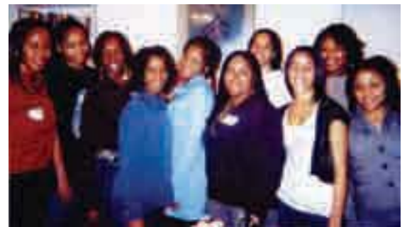
BISA Scholars at the BISA house for a workshop.